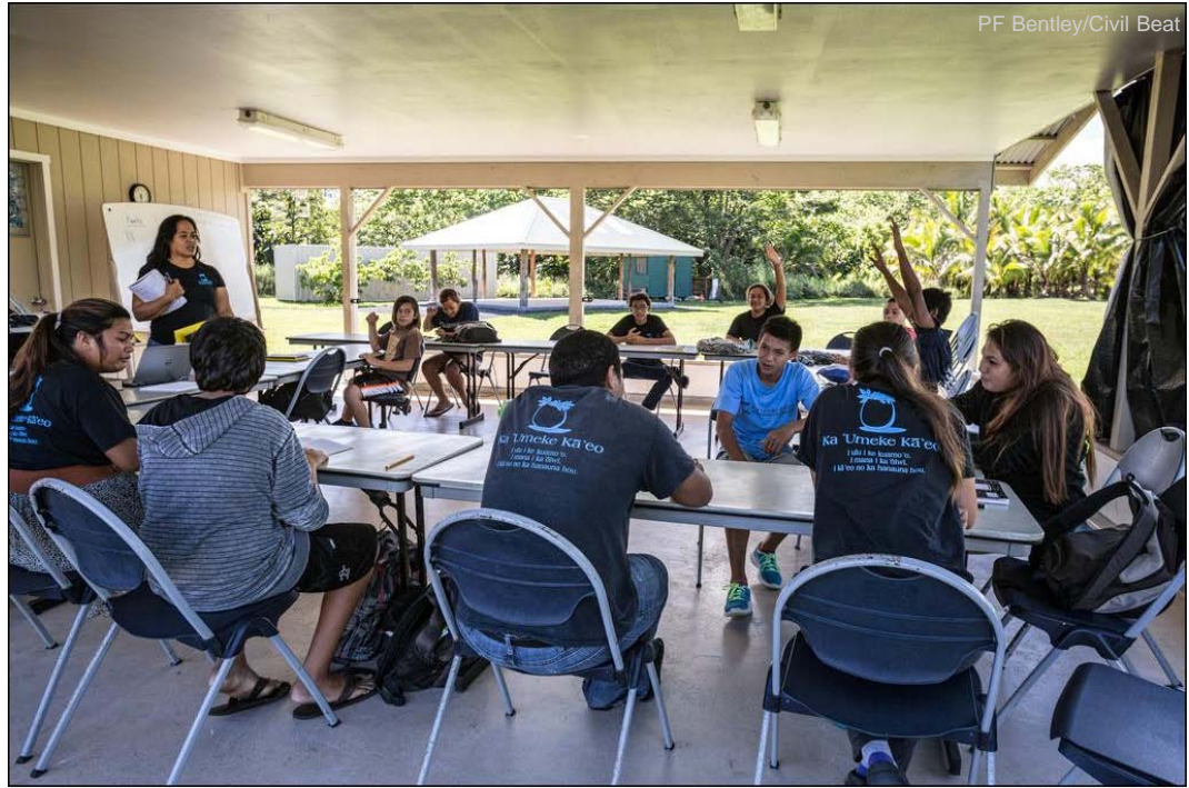
A typical "classroom" at Hilo's Ka Umeke Kaeo charter school. Photo taken in October 2013.

It's time for a quiz. Which of the following is true about many of Hawaii's charter schools?